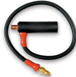
225 028 50-mm thread lock-style for water-cooled torch.