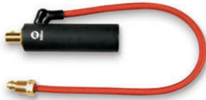
195 377 50-mm Dinse-style with water return line for water-cooled torch.