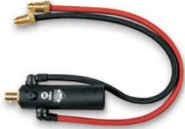
195 380 50-mm Dinse-style gas thru with gas and water return lines for water-cooled torch.