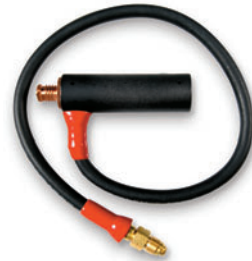
225 028 50-mm thread lock-style for water-cooled torch.