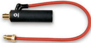
195 377 50-mm Dinse-style with water return line for water-cooled torch.