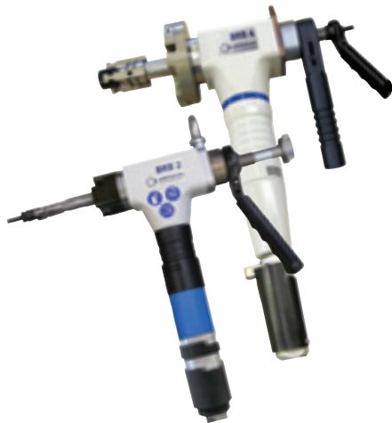
BRB 2 and BRB 4 Pneumatic with clamping system "Standard"