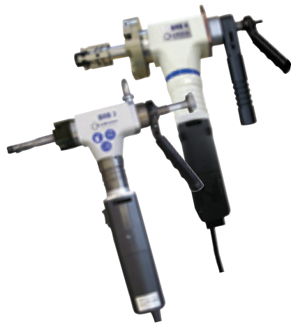
BRB 2 and BRB 4 Electric with clamping system "Standard"