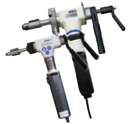
BRB 2 and BRB 4 Electric with clamping system "NC"

A detailed description of the machine, technical specifications and scope of delivery see on page 51. Please specify the required clamping system ("Standard" or "NC"), the application kit (Kit 1 to Kit 5) as well as the drive version (Electric, Pneumatic or Pneumatic/Auto) with your purchase order.