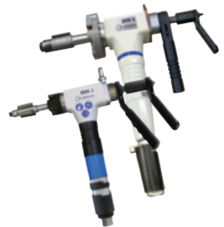
BRB 2 and BRB 4 Pneumatic with clamping system "NC"