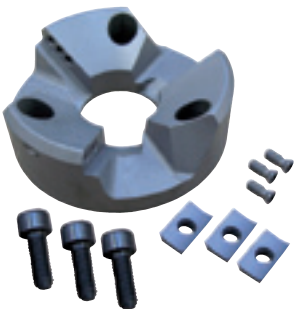
Bevel cutter head for BRB 4