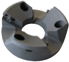
Bevel cutter head for BRB 2