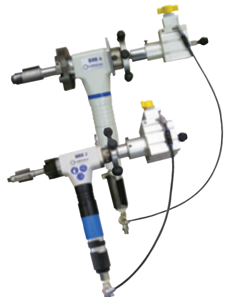
BRB 2 and BRB 4 Pneumatic/Auto with clamping system "NC"