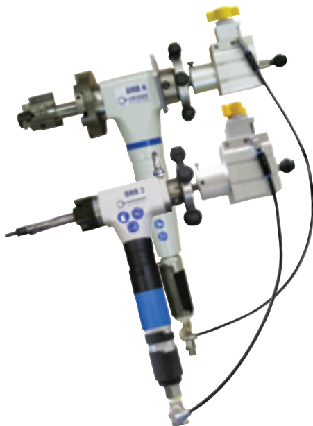
BRB 2 and BRB 4 Pneumatic/Auto with clamping system "Standard"